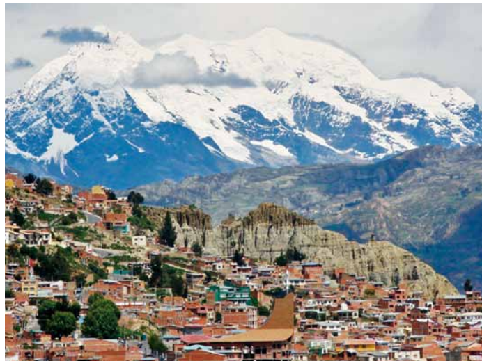
La Paz is Bolivia's capital and third most-populous city