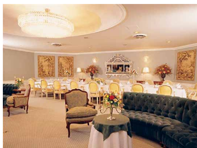
The Radisson offers versatile meeting and banquet facilities

Bolivia is not a conventional tourist destination. The country is relatively little-known and quite different from all its South American neighbors, not only in geography and cultures, but also in its range of ethnic identities. The country's cultural diversity is perhaps partly a product of its diverse geography, which ranges from the mountains of the Andes and the high plateau of the capital, La Paz, to the tropical lowlands of Santa Cruz. It embraces both South America's largest lake and the upper basin of the Amazon. Yet the country received only 1.2 million tourists last year, the overwhelming majority of whom were from other South American countries. However, that figure shows a 17% increase over the previous year and is already four times the volume of tourists at the turn of the century. So the great secret is at last being discovered, surely and steadily.