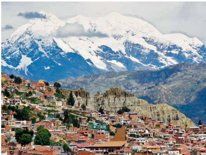
La Paz is Bolivia's capital and third most-populous city