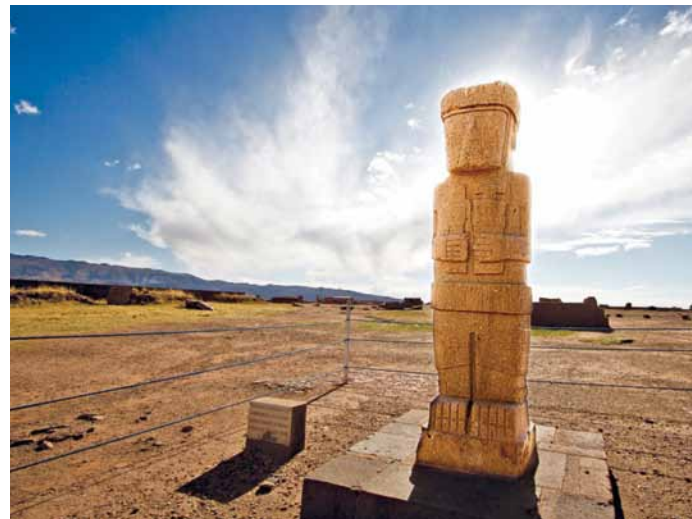
Monolito del Fraile.