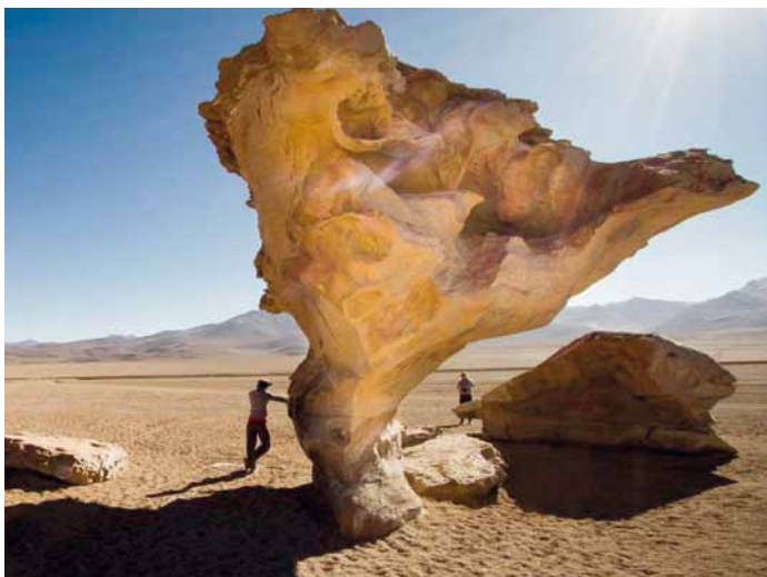
Arbol de Piedra in the Eduardo Avaroa Andean Fauna National Reserve