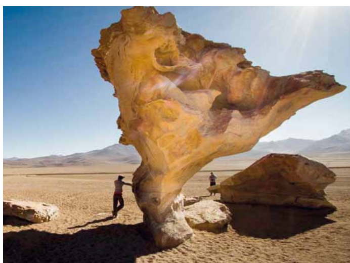
Arbol de Piedra in the Eduardo Avaroa Andean Fauna National Reserve