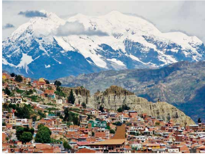
La Paz is Bolivia's capital and third most-populous city