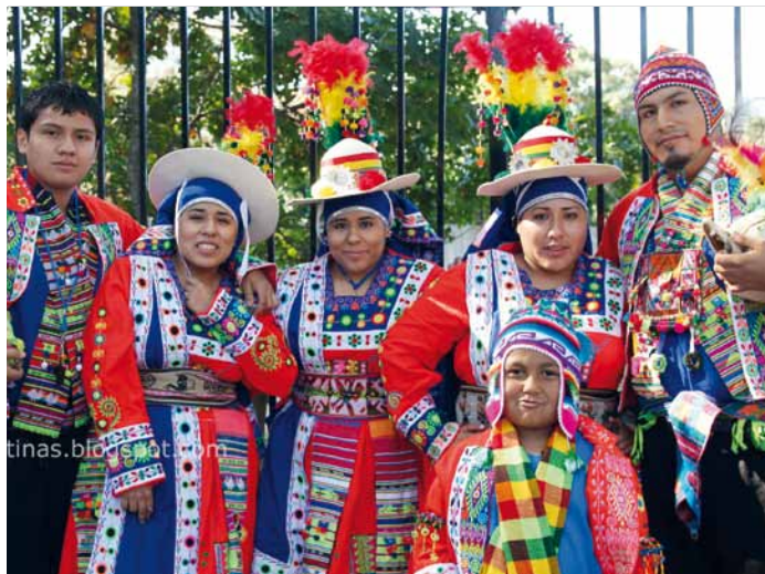
There are 36 recognized ethnic groups in Bolivia today

TOURISM The Andean nation's attractive cultural heritage becomes accessible to tourists as infrastructure improves