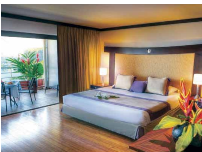
One of the Radisson Plaza Hotel La Paz's 153 rooms and suites