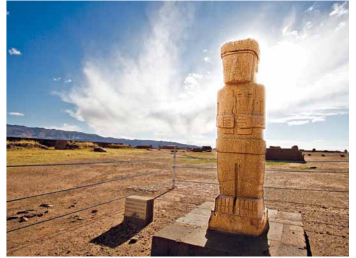
Monolito del Fraile.