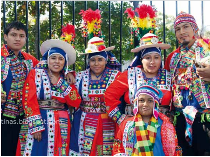
There are 36 recognized ethnic groups in Bolivia today

TOURISM The Andean nation's attractive cultural heritage becomes accessible to tourists as infrastructure improves